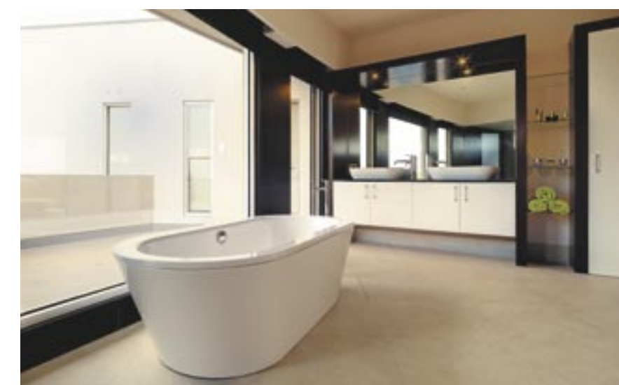
Above In-house theatre entertainment is at your fingertips in the theatre room. Right top Vinyl-wrap and timber-veneered cabinetry add character to the spacious and modern kitchen. Right centre Long hanging lights set the mood in the bedroom. Right below The contemporary bathroom is stylish and the deep bath is perfect for relaxing.

VARCON CONSTRUCTIONS (AUST) PTY LTD Factory 4, 24-28 Hampstead Road, Maidstone Vic 3012 | Tel 03 9318 6100 | Fax 03 9318 6011 | Email sales@varcon.com.au Website www.varcon.com.au | Design Graham Jones Design